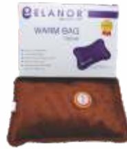
Warm Bag Velvet