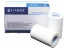
Microporous Surgical Tape