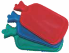
Rubber Hot Water Bottle