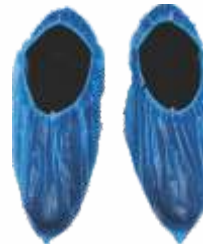
PE Shoe Cover