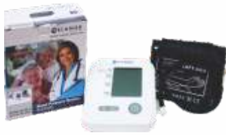
BP Monitor BLPM-13