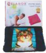
Warm Bag Velvet Pocket