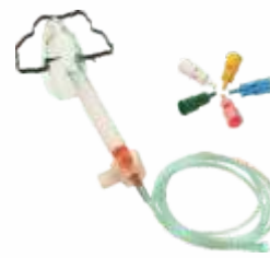
Adjustable Venturi Mask