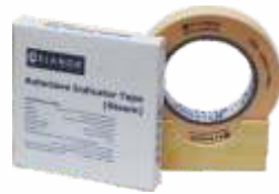
Autoclave Indicator Tape