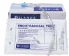
Endotracheal Tube Cuffed