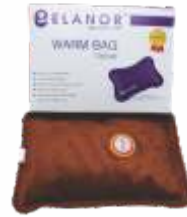
Warm Bag Velvet