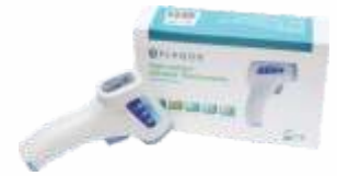
Non-Contact Infrared Thermometer