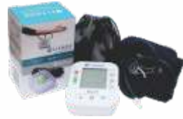
BP Monitor EL21