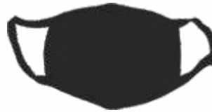
Black Face Mask