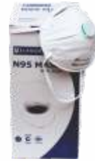
N95 Face Mask with Valve