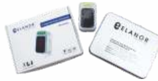
Fingertip Pulse Oximeter