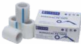
Surgical PE Tape