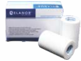
Microporous Surgical Tape