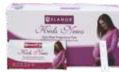
Pregnancy Test Card