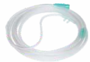
Twin Bore Set