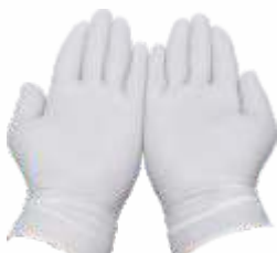
Latex Examination Gloves