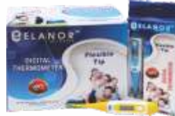
Flexitip Digital Thermometer