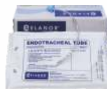
Endotracheal Tube Plain