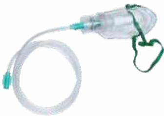
Nebulizer Mask with Chamber