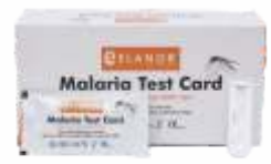
Malaria Test Card