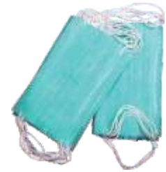
Non-Woven Face Mask