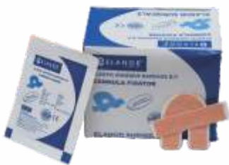
IV Cannula Fixator