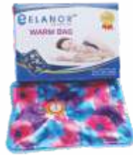
Warm Bag Plain