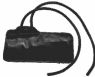
Rubber BP Bladder