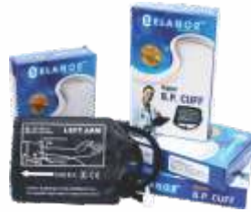
Digital BP Cuff